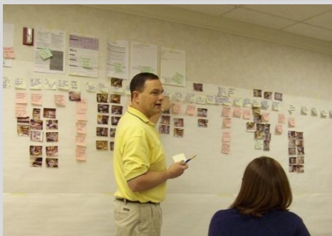
Kaizen & 5S Tools

Introduction to Lean Healthcare with a full day of hands-on simulations